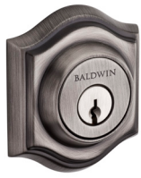
Traditional Arch (TAD)