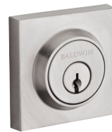
Contemporary Square (CSD)