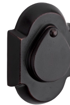
Rustic Arch (RAD)