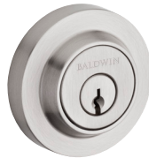
Contemporary Round (CRD)