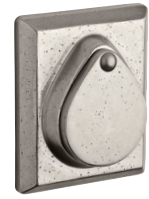
Rustic Square (RSD)