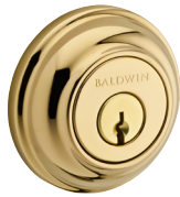
Traditional Round (TRD)