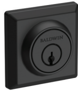
Traditional Square (TSD)