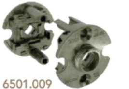
6501.009 Small Bore Lever Adaptor