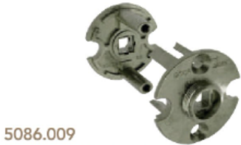
5086.009 Small Bore Knob Adaptor

A more minimal hardware footprint brings a heightened sense of refinement to the door look. Engineered for precision installations, small bore adaptors allow Baldwin hardware to perform within a 1.5" bore configuration without compromising strength or stability. By reinforcing the connection point within the door, they preserve the smooth operation and lever integrity synonymous with Baldwin.