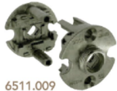
6511.009 Small Bore Heavy Lever Adaptor